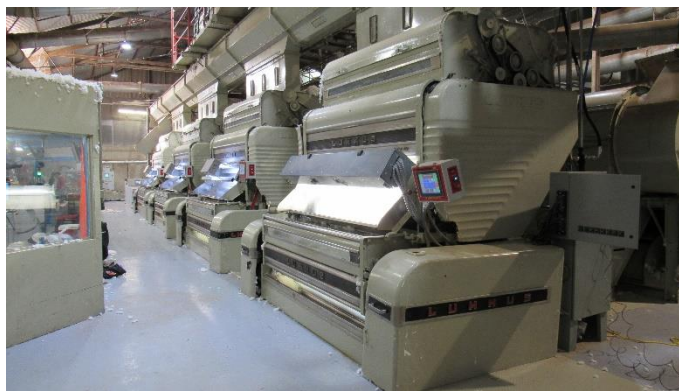
Figure 2. Spade Co-op Gin, Inc. in Spade, Texas.

TAMA, the manufacturer of round module wrap, provided sheets of five (5) colors of module feeder plastic wraps for use in the 2020 testing. The sample colors were conventional yellow and pink, along with two types of green (non-tacky/opaque and tacky/translucent) and blue (non-tacky). Figure 3 shows the colors used in the study.