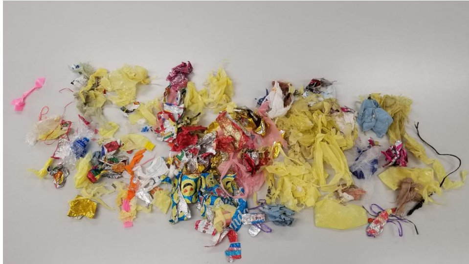
Figure 8. Contamination detected/ejected in 35,000 bales at Southeastern Gin during 2020/21 gin season.

Southeastern Gin operated their VIPR™ systems throughout the entire 2020/21 ginning season. Figure 8 shows the various types of contamination that were detected and ejected by the VIPR™ during the processing of 35,000 bales of cotton. While a major rationale for the development of the VIPR™ was to address round module plastic wrap contamination, Figure 8 clearly demonstrates that while module wrap does contribute to some of the contamination, all types and kinds of contamination make their way into the ginning system.