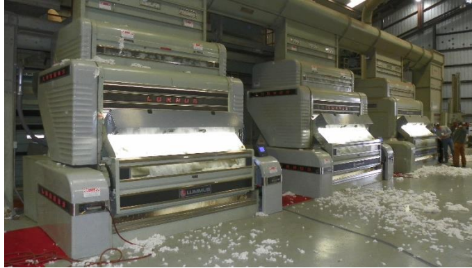
Figure 1. Southeastern Gin & Peanut, Inc. in Surrency, Georgia.