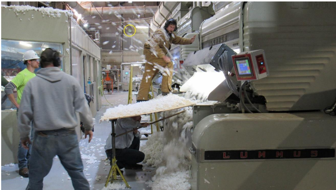
Figure 5. Contamination ejection (circled in yellow) at Spade Co-op Gin.

Each of the lines being tested was isolated, so that the rest of the gin plant could continue commercial operation on the balance of the machinery. On the test line, the fire door on the gin front was engaged, so that the seed cotton and any undetected contamination pieces would fall to the floor, allowing for collection and accounting of the undetected pieces at the end of the replication. A photo of a typical ejection during the testing is shown in Figure 5.